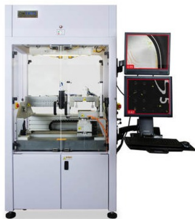
Defect Detection System - Front View

Featuring deep learning technology, the DWFritz Defect Detection System quickly identifies defective or anomalous parts, helping manufacturers reduce costs and meet consumer quality expectations.